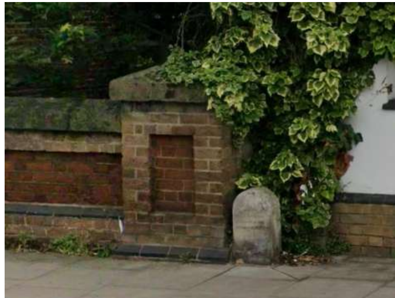
Boundary marker at back of pavement on Lee Road bridge

The area also has historic significance as a result of key events and activities which took place there.