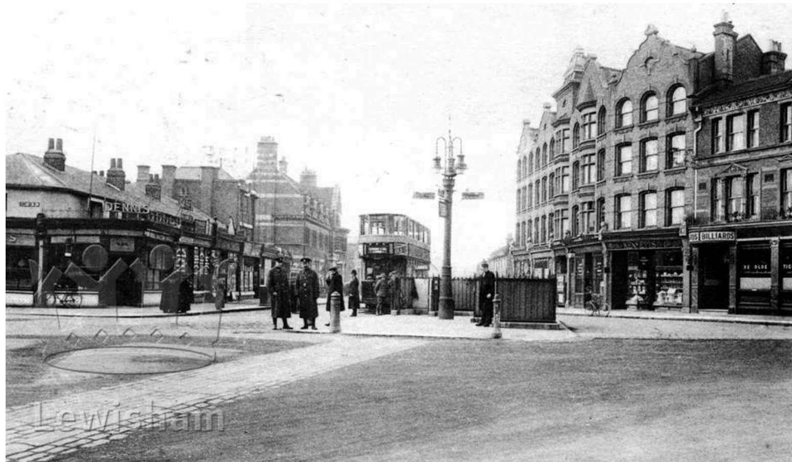
Undated photograph of Lee Green looking towards Lee High Road and Lewisham, with 343-349 Lee High Road visible to the right.