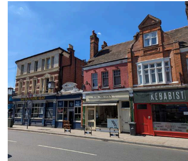
Clockwise from top left: 349 Lee High Road and the Old Tiger's Head, 120-128 Lee Road, Old Tiger's Head and 120-128 Lee Road, Former Police Station at 418 Lee High Road (Grade II listed)