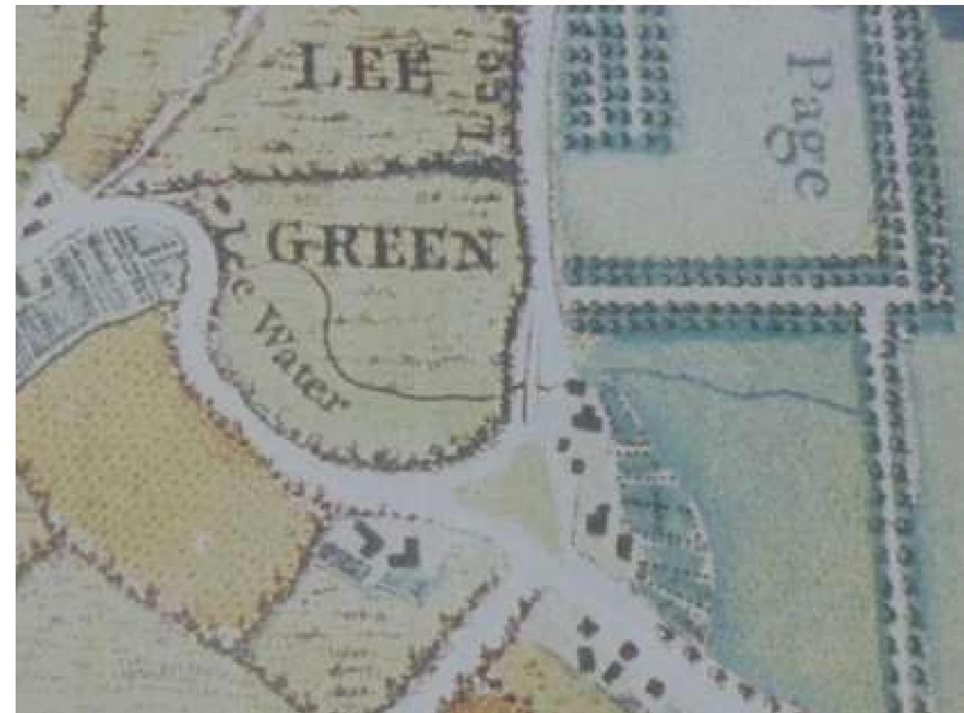
John Rocque Map of London, published 1746