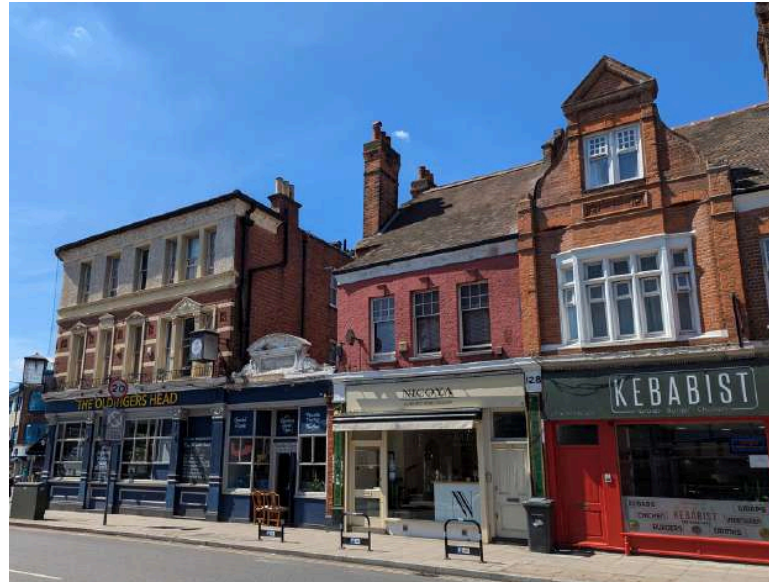
Traditional shopfronts on Lee Road