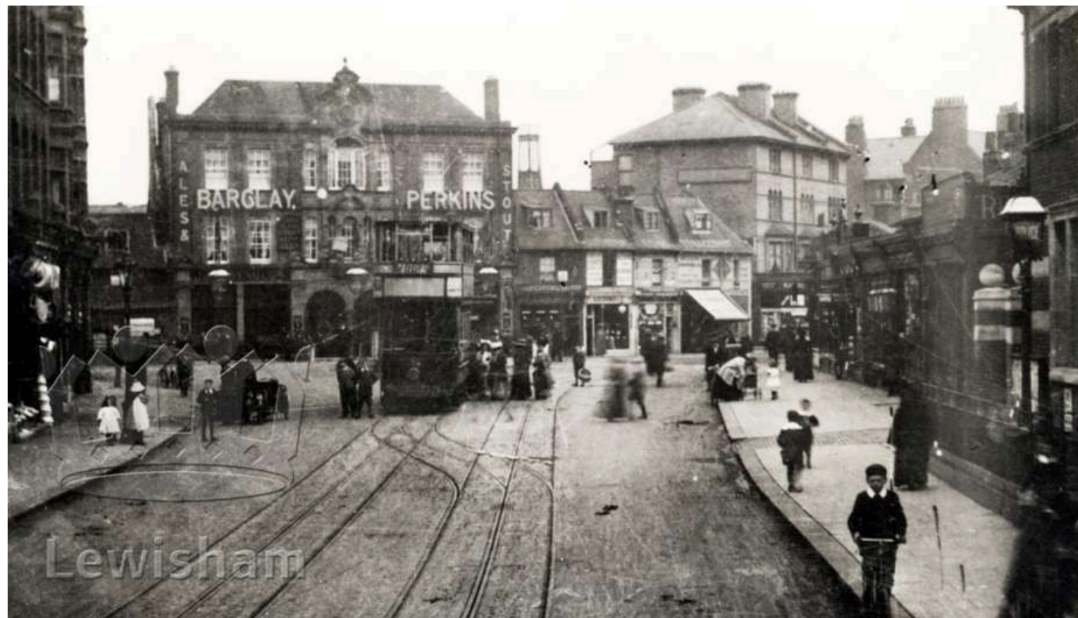
Undated photograph of Lee Green looking towards the New Tiger's Head, now the Blackheath Food Centre, in the Royal Borough of Greenwich