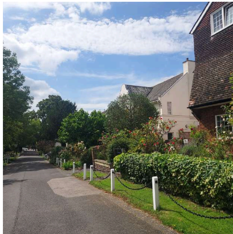
Chain and post fence