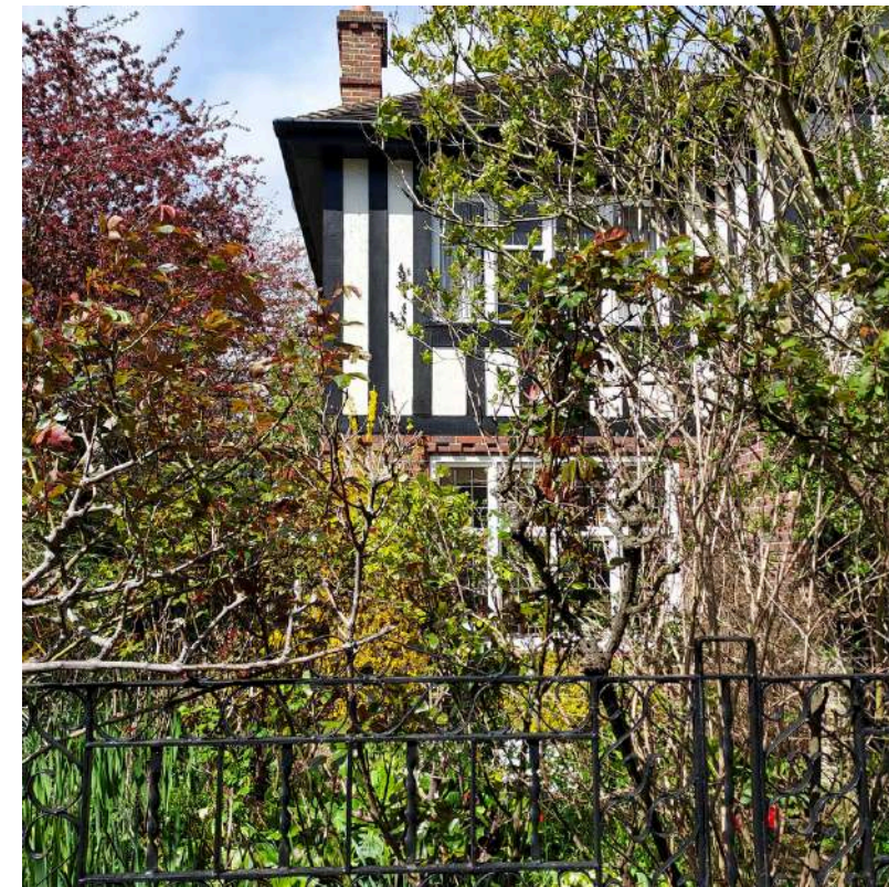
Extensive planting in green verges, central lawn and front gardens