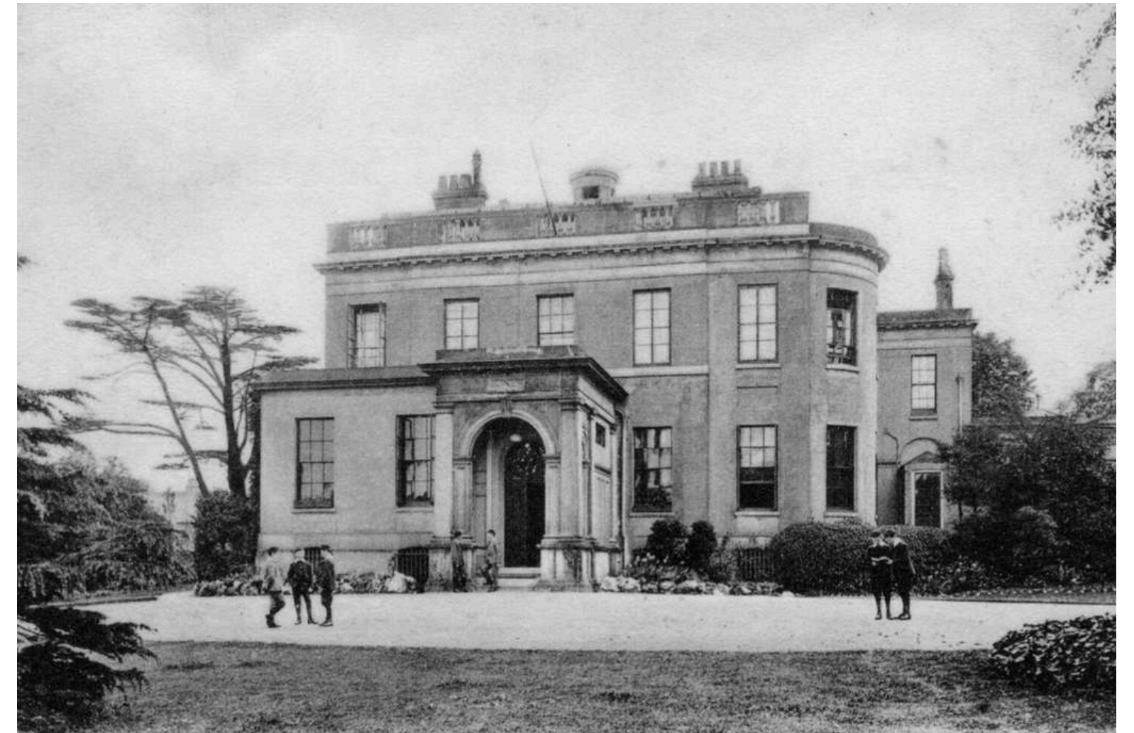
Sydenham Hall before its demolition.