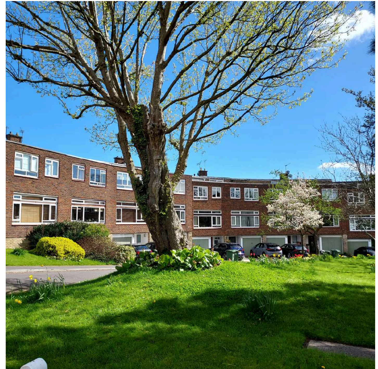
37-75 Hall Drive