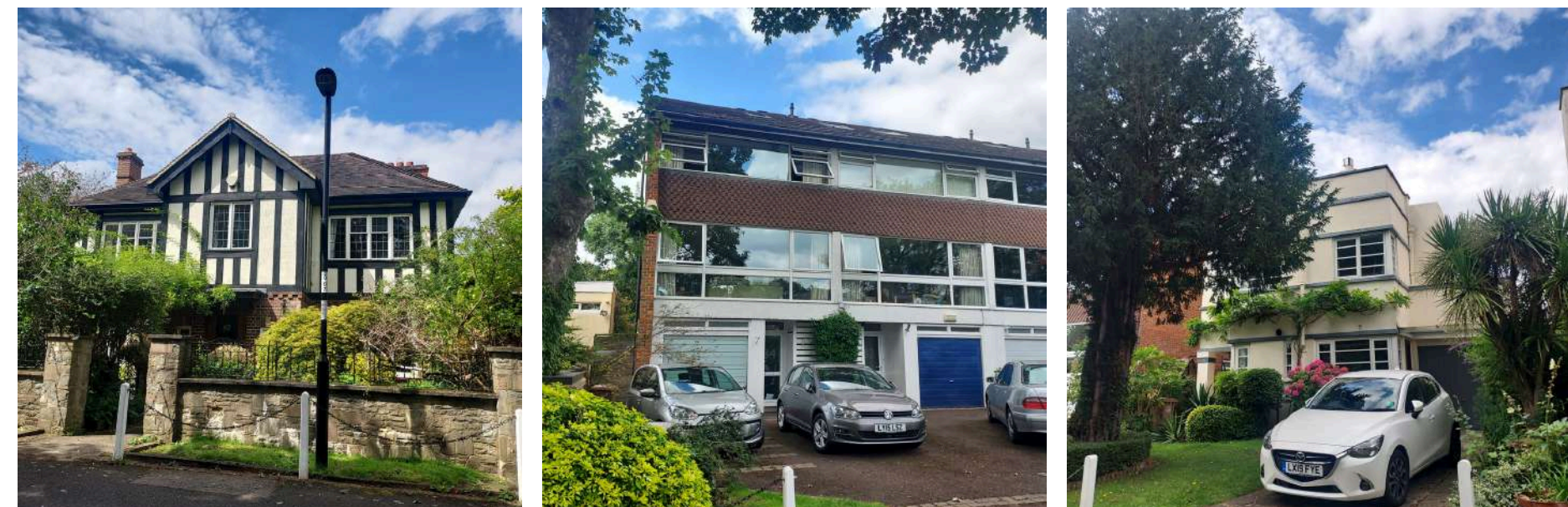
Eclectic mix of housing, abundant vegetation and chain and post fence

The green verges, soft planted front gardens with mature trees and dense shrubs, the presence of coherent boundary treatments, and the planted lawn in front of 37-75 Hall Drive, with trees, bushes and landscape features, create a very green and peaceful environment, which contrasts with the busy neighbouring roads.