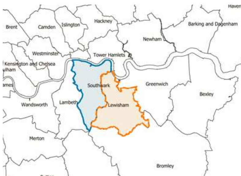
Map 1: Map showing Lewisham and Southwark