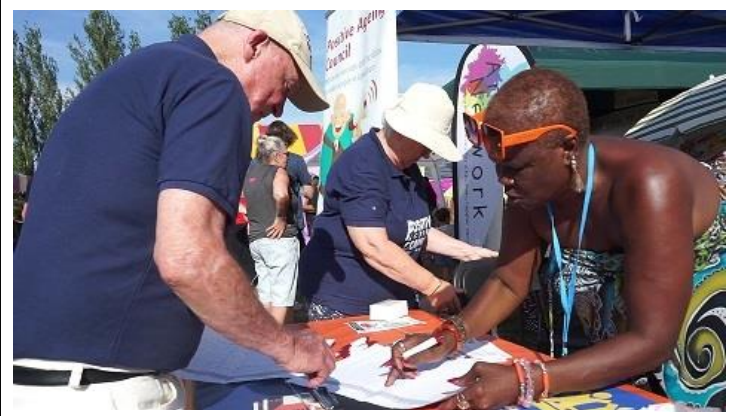
A new member signs up to POSAC

including several councillors and Mayor Damien Egan, we succeeded in signing up over 50 new members – a stunning result!