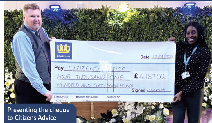
Presenting the cheque to Citizens Advice

Keep an eye on lewisham.gov.uk/pride-month for Pride Month events in Lewisham.