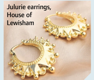
Julurie earrings, House of Lewisham

Support your local makers and explore the House of Lewisham marketplace today at thehouseoflewisham.com