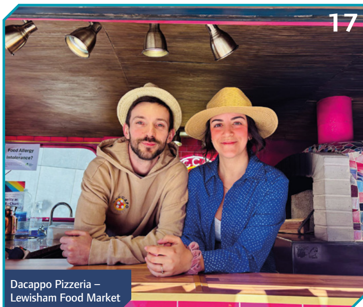
Dacappo Pizzeria – Lewisham Food Market