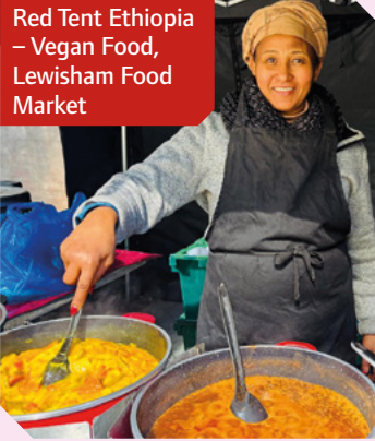
Red Tent Ethiopia – Vegan Food, Lewisham Food Market

and surround sound. Friday 20–Sunday 23 June. Downham Library BR1 5EP. Free.