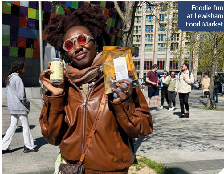
Foodie fun at Lewisham Food Market

Whether you're a foodie, or just looking for a fun Sunday outing, this market has something for everyone. It's also free and dog-friendly.