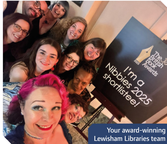
Your award-winning Lewisham Libraries team

We want to extend our thanks to everyone who made these events possible, including our dedicated staff, enthusiastic volunteers, talented authors, creative poets, supportive partners and all the wonderful attendees. To find out what else is happening at our award-winning libraries, visit libraries.lewisham.gov.uk/events