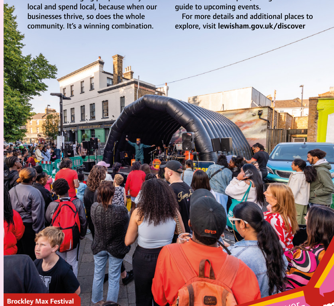
Brockley Max Festival

For more details and additional places to explore, visit lewisham.gov.uk/discover