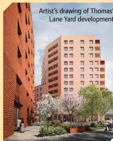
Artist's drawing of Thomas' Lane Yard development

We have been working hard to progress plans for the Thomas' Lane Yard development at the north of Catford Broadway. The plans include 113 affordable homes, a central communal space (next to the soon-to-reopen Catford Constitutional Club), over four tennis courts' worth of business and office space, and new green and public spaces for everyone to enjoy. We're pleased to say the proposal has just been approved by our planning committee, meaning the project is now one step closer to serving our community. We expect works to begin late next year.