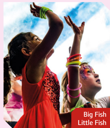
Big Fish Little Fish

Helios is a giant sculpture by Luke Jerram, representing the sun with solar imagery, sunlight