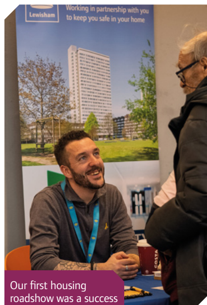
Our first housing roadshow was a success

Find out more about our new Resident Engagement Strategy and how you can get involved at lewisham.gov.uk/get-involved