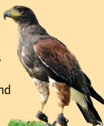
Artist's drawing of the updated Lewisham Market. Above: Bella the Hawk

One of the highlights is Plough Bridge Pocket Park, a brand-new green space at the north end of the high street, which features a striking sculpture by local artist Anna Reading, commemorating the 1968 flood. The space also includes Sustainable Drainage Systems (SuDS) to manage rainwater, reduce flooding and support local plants and wildlife.