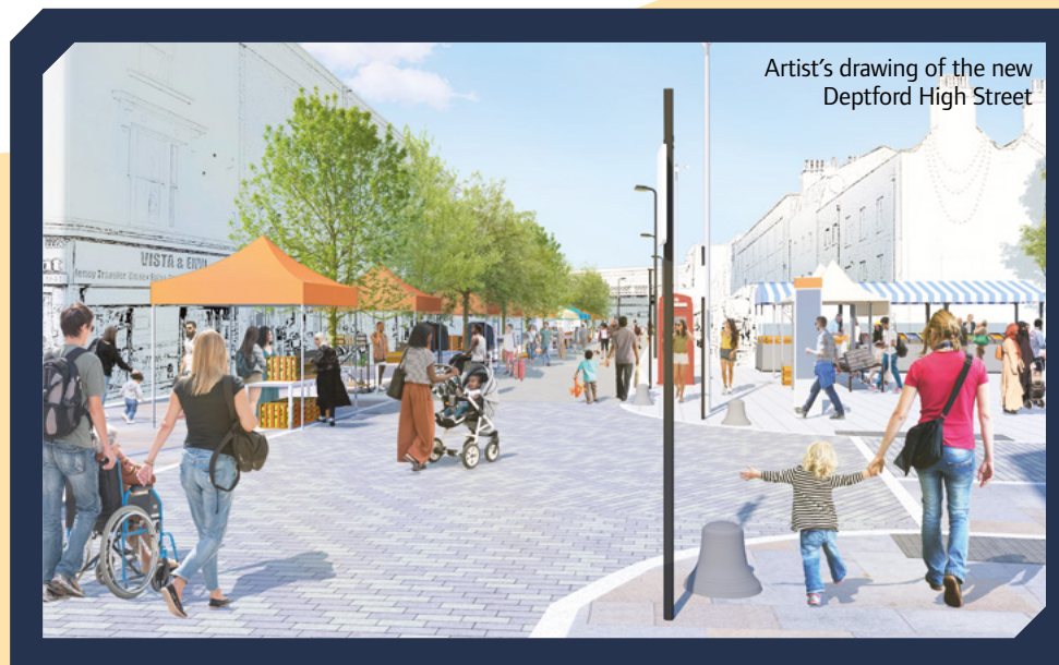
Artist's drawing of the new Deptford High Street

You may have noticed a few changes at Lewisham Market as redevelopment begins. The market will stay open throughout the 18-month construction, so you can still shop with your favourite traders, although they will temporarily move to nearby pitches before settling into their permanent spots.