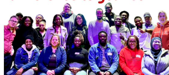
The 2025 Phase 1 Changemaker cohort.