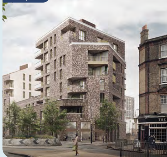
1 Creekside development

Find out more about shared ownership and register your interest in the 1 Creekside development at lewisham.homes/creekside .