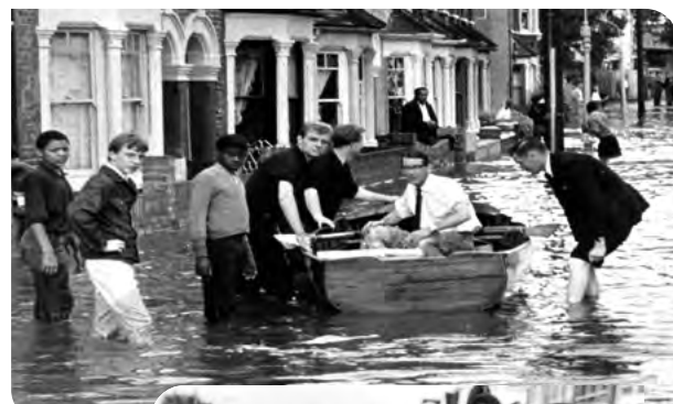
The 1968 floods