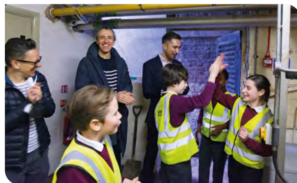
Dalmain Primary School switch off their gas boiler

We're also planning to roll out food waste