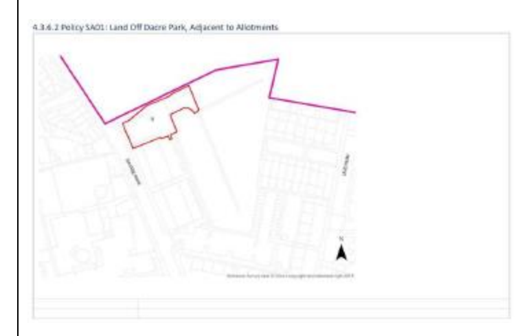
Objection to proposal SH01

The LNP proposes that land off Dacre Park is allocated for residential development provided that access to the allotments from Dacre Park is maintained. It shows the area for development totalling 913.8sqm as shown below.