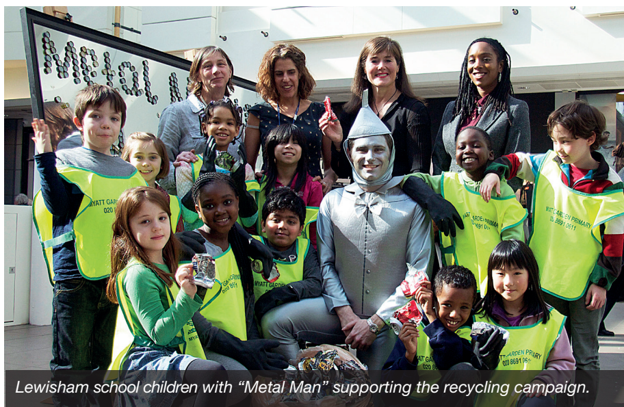
Lewisham school children with "Metal Man" supporting the recycling campaign.