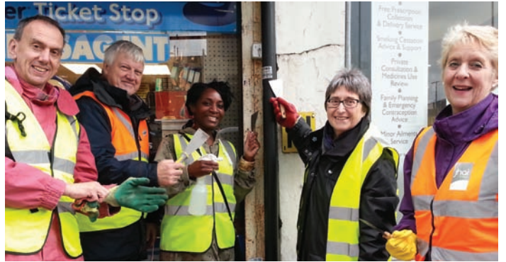
Sydenham councillors join locals in removing ugly stickers from the high street

flyposting, dumped cars, faulty street lighting, flytipping and graffiti. Or you can call LBL on 020 8314 7171.