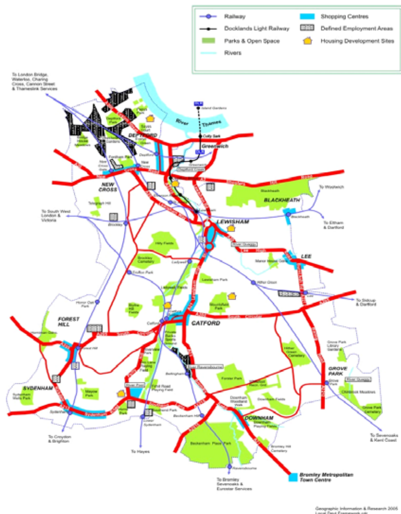
The map of Lewisham shows areas of key influence on the LDF. These areas include Shopping Centres, Defined Employment Areas and Transport and Open Spaces networks.