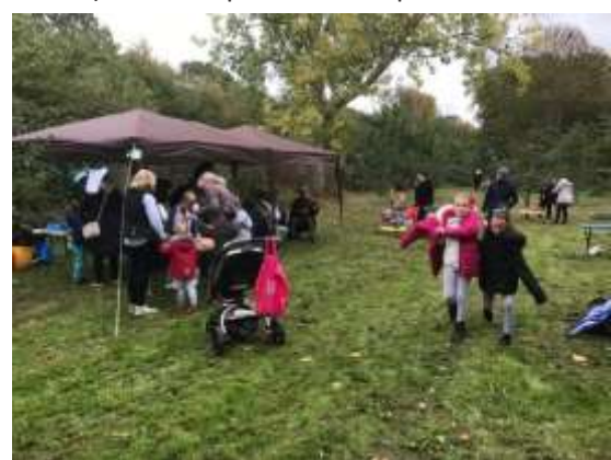
d). Chart Apple Day at Chinbrook Meadows Oct 7 2017 - Neighbourhood Plan Consultation table