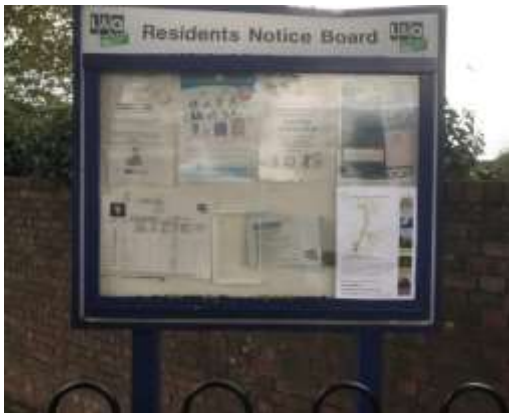
b) Poster up on residents board