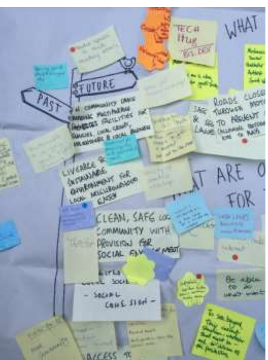
Table 3 summarises the key events that took place to gather input from residents on the development of Grove Park's Neighbourhood Plan. It details the key objectives of each event, and the main outcomes.

The appendices provide further imagery to evidence the events.