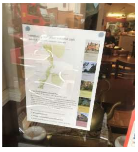
e). Poster up in local shops and cafes