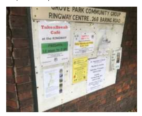
d). Poster at The Ringway Centre