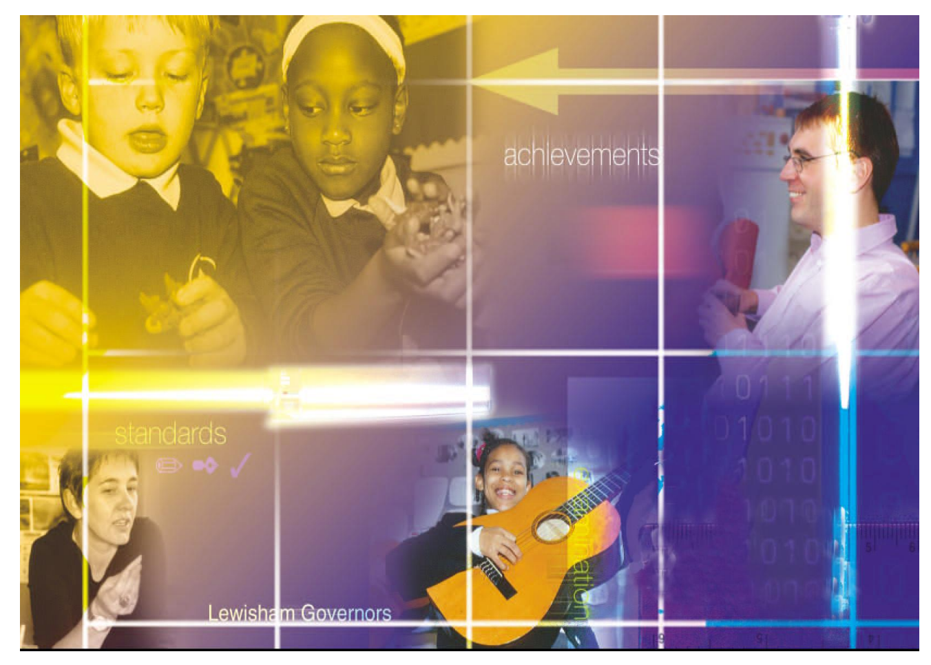
School Governors Welcome Pack