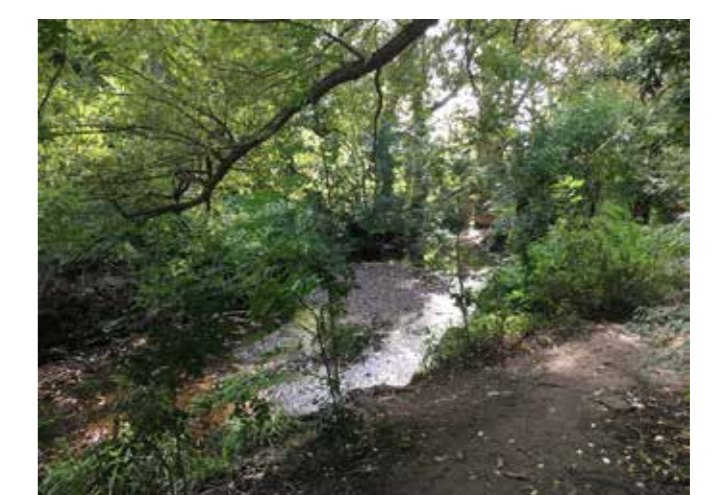
Existing photos of the park and river