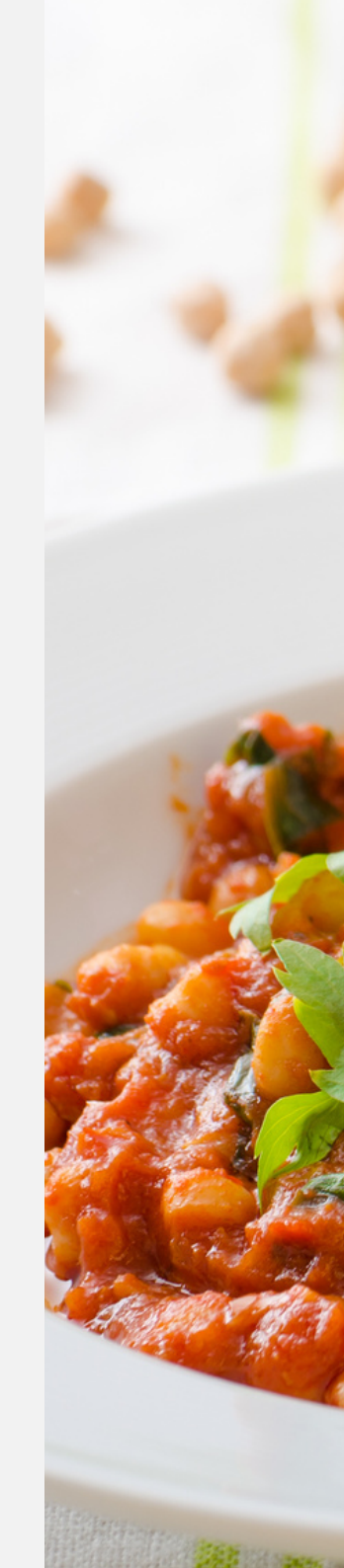
Date published: July 2022 © Written by Tai Ibitoye RD (Registered Dietitian) Commissioned by Lewisham Council